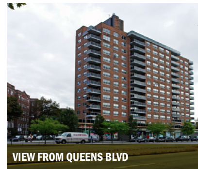
VIEW FROM QUEENS BLVD