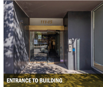
ENTRANCE TO BUILDING